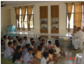
Visitors from Pakistan at Ashray Bhavan