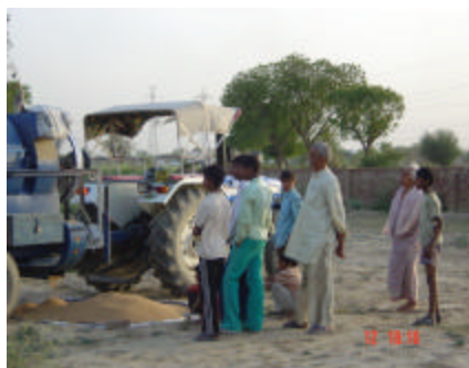
Harvesting & Threshing of Wheat at Ashray Bhavan